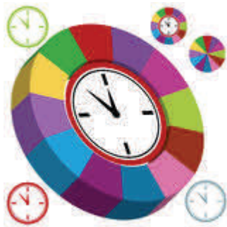
Daylight Savings—March 8