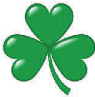
St. Patrick's Day—March 17