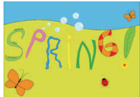
1st Day of Spring—March 21