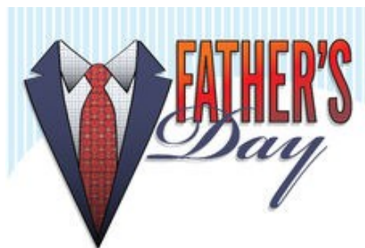
Father's Day, June 21