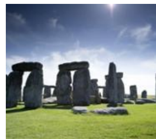
Summer Solstice, June 21