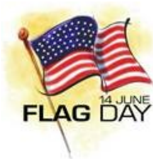
Flag Day, June 14