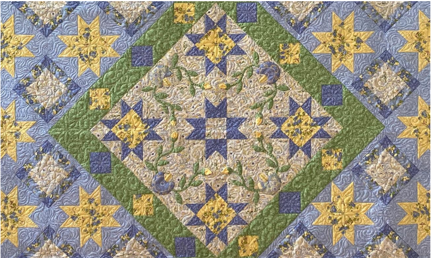
Center portion of Sunshine and Roses

Remember, the raffle drawing will take place at the June 5, 2023 FSQ Guild meeting and a portion of the profits will go to our chosen charity this year which is Manna Food Center. The seller of the WINNING ticket is always rewarded with a gift and the TOP three ticket sellers are eligible for prizes. I look forward to your support for this endeavor which supports all the guild activities. Please let me know if you have any questions.