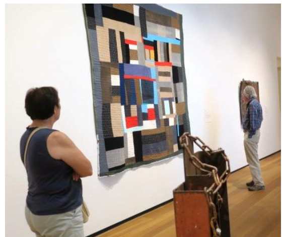
Blocks and Strips quilt by Mary Lee Bendolph