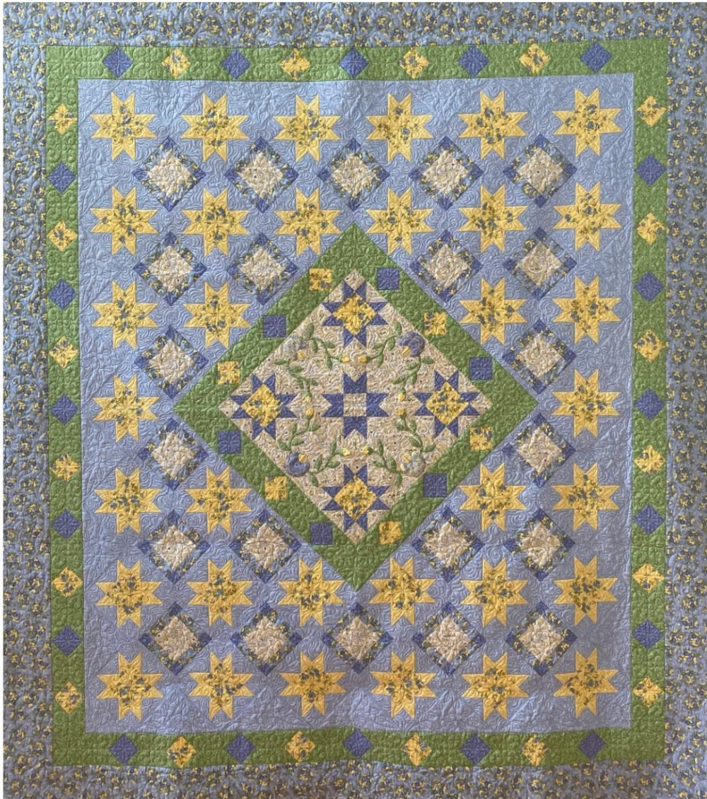
Sunshine and Roses

Remember, the raffle drawing will take place at the June 5, 2023 FSQ Guild meeting and a portion of the profits will go to our chosen charity this year which is Manna Food Center. The seller of the WINNING ticket is always rewarded with a gift and the TOP three ticket sellers are eligible for prizes. I look forward to your support for this endeavor which supports all the guild activities. Please let me know if you have any questions.