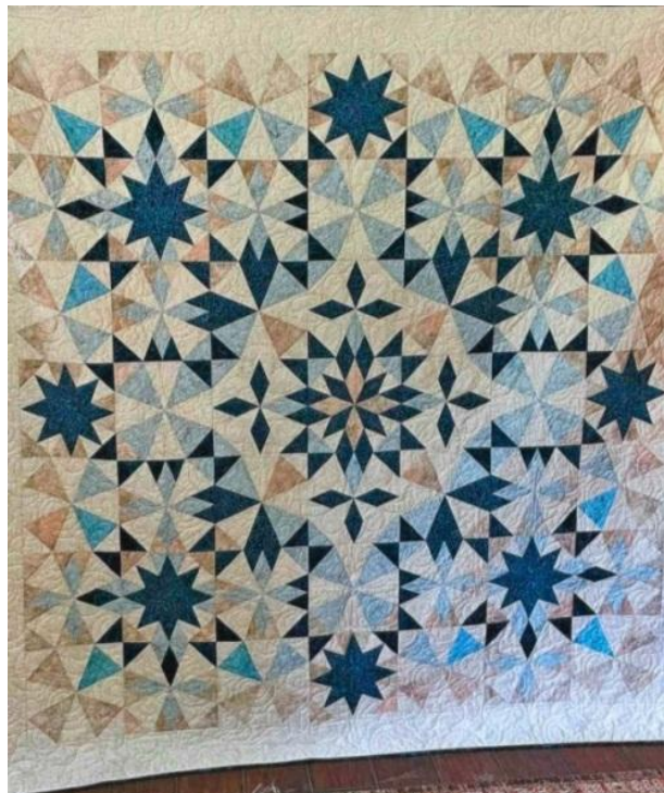
Alaska – FSQ's 2024 Raffle Quilt

The more tickets we sell the greater our donation to A Wider Circle and the addition to our treasury.