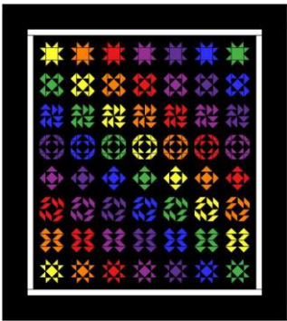
Quilter's Rainbow: The 2025 FSQ Raffle Quilt

First, a reminder that your completed blocks for the Quilter's Rainbow - the 2025 Friendship Star Raffle Quilt - should be turned in by the March FSQ meeting. You can turn blocks in at the retreat, or at Service Projects, if you will not be at the March meeting. Please turn in the block in the numbered envelope.