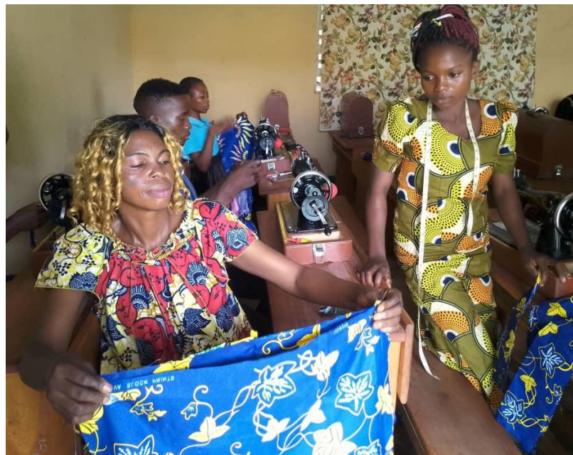
Students at Reve Kandale practicing their sewing