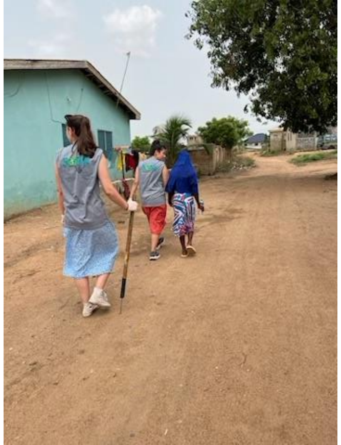
A trip through town in Ghana