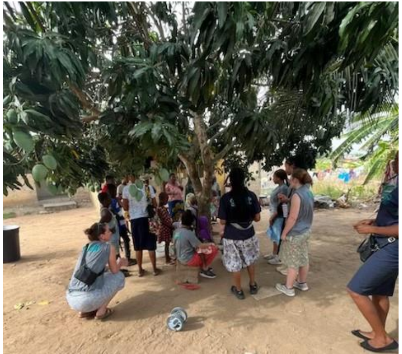
Handing out baby bundles and little girl dresses under the mango tree