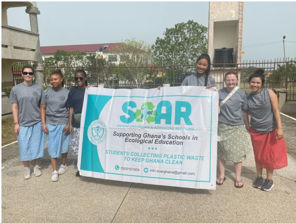
Students in “modest” skirts as they head out to collect plastic

The Sisters of the Holy Cross have missions in 8 countries. In Ghana the problem of plastics is due to imported goods and the lack of infrastructure has caused a huge environmental, social, and health crisis. The plastics are causing havoc by clogging drainage, causing flooding, and the standing water is a breeding ground for malaria, cholera, and typhoid. Making cloth bags and reversible dresses could help with some of the plastic issues.