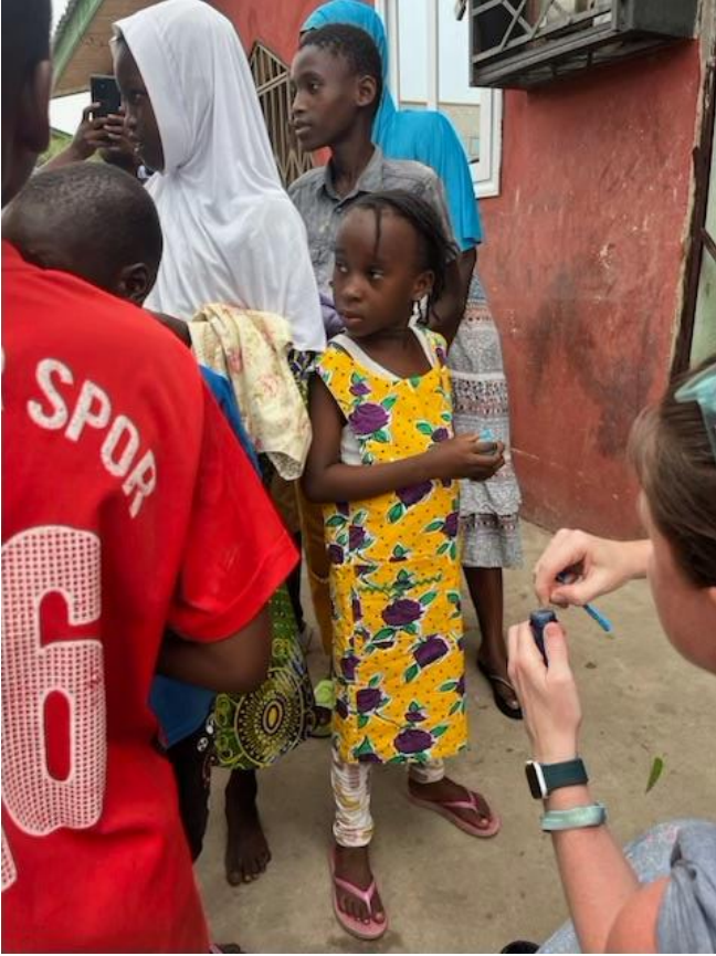
New owner of one of the reversible dresses