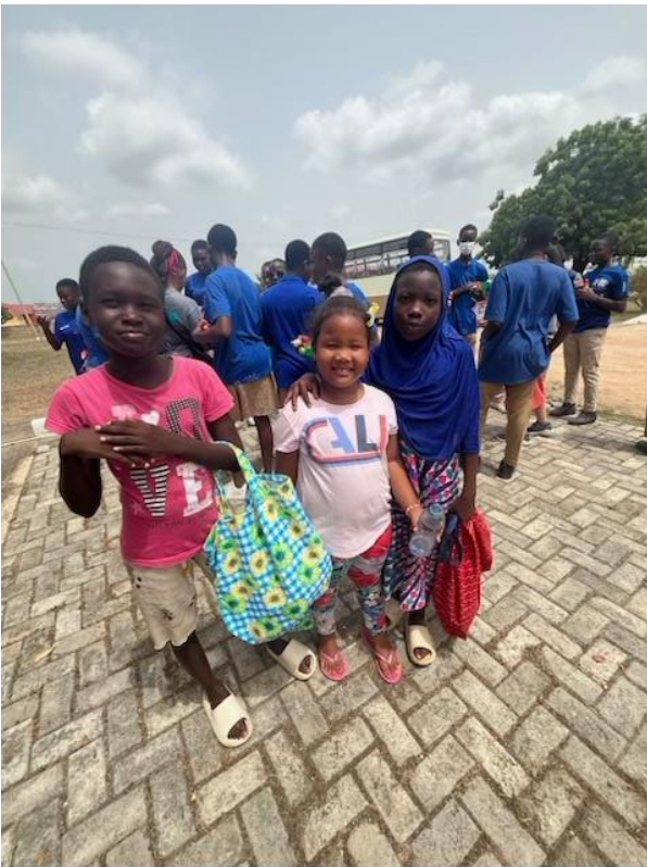
Flowered fabric on one of the cloth bags