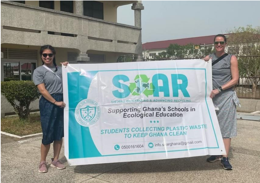
Faculty ready to collect plastic also wearing their “modest” skirts,