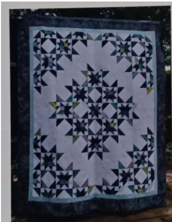
Under the Stars 94 x 78