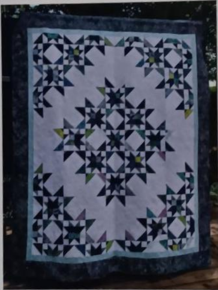
Under the Stars 94 x 78